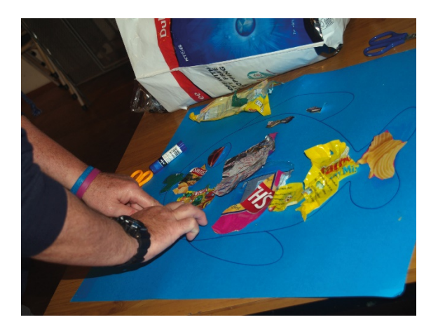
You will need: a large piece of card with a fish outline drawn on it; glue; scissors; recycled plastic wrappers

Glue pieces of plastic on to the fish. This will be used later in the celebration and prayers.