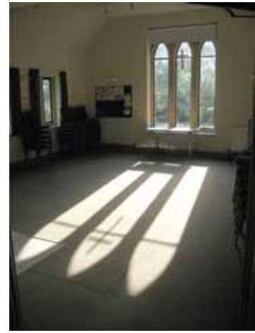
The Church Hall

The hall is well-used by a number of community groups such as The WEA, Yoga, Knit and Natter. It also has an upstairs room used as a devotional/meeting area and a quiet area for the Youth Group.