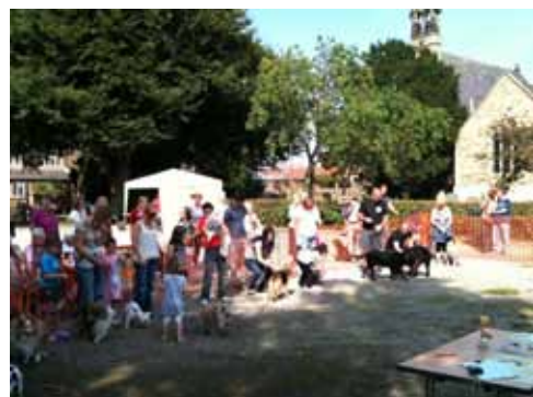
'Scruffs' Dog Show 2012