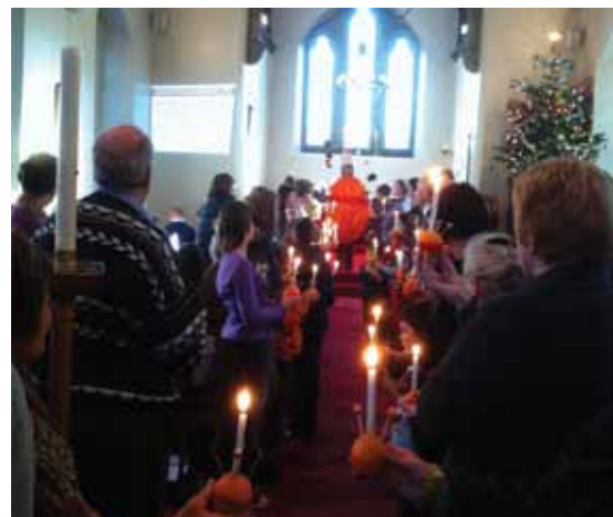
First Sunday Christingle service

We are fortunate to have a regular Organist and a church member who also plays. We do not have a choir at St.Nicholas' Church, although a group of singers may come together for special occasions.