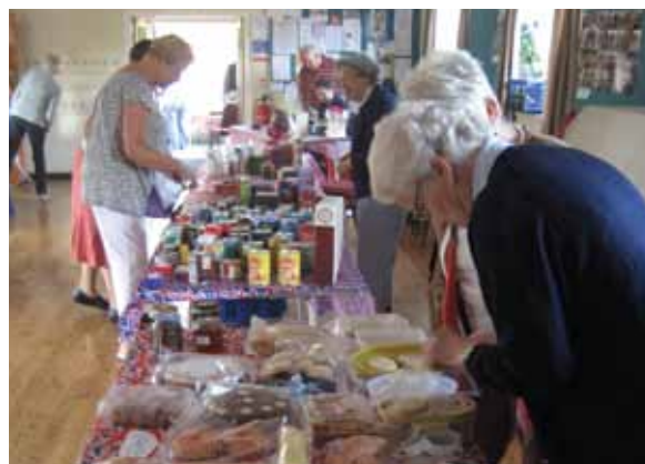
St.Mary's Autumn Fair 2012

Further information on all our groups can be found in the Annual Reports of both churches, available on our Benefice website.