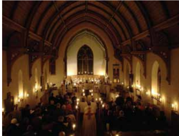
The church candlelit for the annual service of Nine lessons and Carols

Situated in the centre of The Village, St Mary's Church was built in 1878 and extended in 1911.