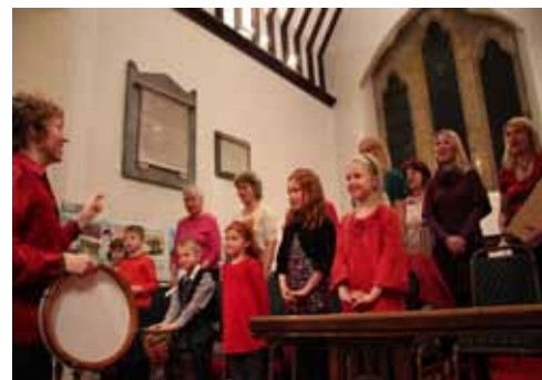
Service of dedication of the new window to celebrate 150 years of the church building