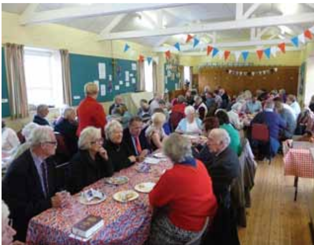
St Mary's Church Hall in use for the Queen's Jubilee celebrations in 2012

The church is open during weekdays and is used regularly by people for prayer or quiet meditation. Our visitor book pays testimony to the building's feeling of peace and light.