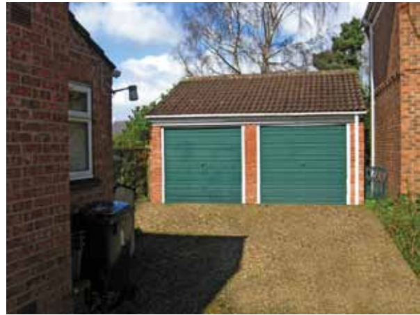
The Rectory at Back Lane, Wigginton

The Curate's House at Westfield Close is a detached house. On the ground floor there is a cloakroom and W.C., a dining room overlooking a rear patio area, a good size living room, kitchen and study. Upstairs there are four bedrooms and a bathroom. There is a good sized garage and pleasant, easily-maintained gardens to the front and rear of the property