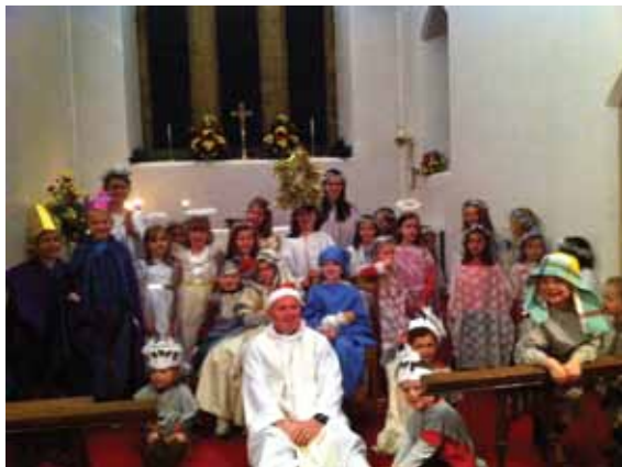
Christmas Crib service 2012

For the last 2 years, following the increasing success of our Youth Club , which takes place fortnightly on Friday evenings, activities have also been offered to them during Holiday Club and the interest is enormous. Visits to a range of venues such as Marrick Priory Outdoor Centre are arranged and this year we are looking forward to the 'Big Night Out' Christian Rock Concert at Lightwater Valley theme park.