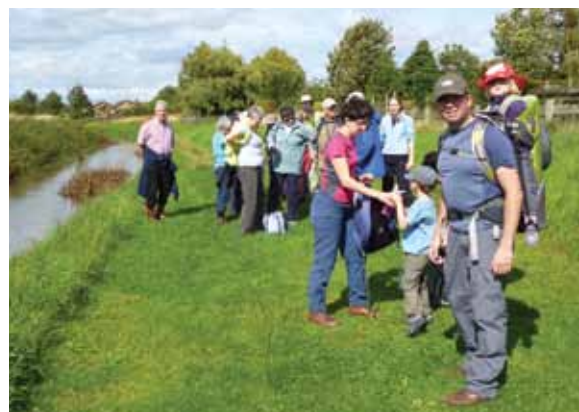
Recent Parish Walk