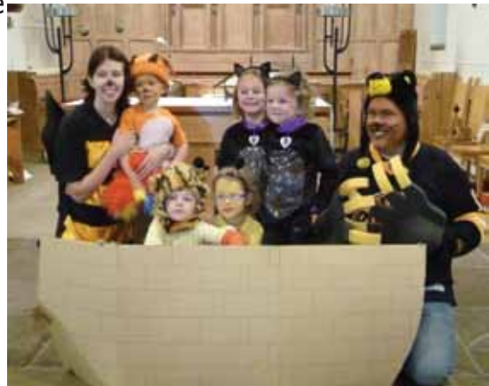
The children lead a Noah's Ark service