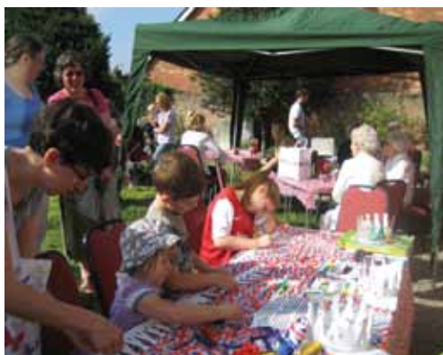
St Mary's Autumn Fair 2012

St.Mary's has a wide range of active groups, including: