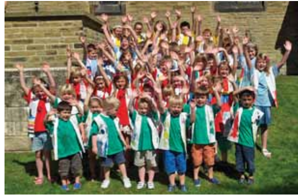
Holiday Club 2012

As well as our regular services aimed at Families and Young People ( 1st Sunday All Age , Tuesday morning Tots and Toddlers service and Sunday morning 'Bright Sparks' group for Primary School-aged children), we provide a Good Friday workshop which is well-attended, and for the last 12 years we have provided a very successful 3-day Holiday Club in August, for up to 50 children which ends with a barbecue celebration for all the families